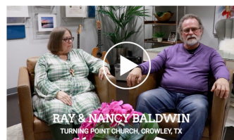
Community Impact: Expanding Ministry

Click the button below if you want one of our team members to contact you with more information!