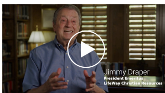
Connecting Your Church with Your Community